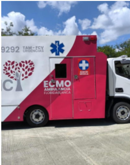
Lateral view: the HIC ECMO Ambulance in its distinctive institutional crimson

The lateral crew bench allows the ECMO team — an intensivist physician, a perfusionist nurse, and a medical assistant — to travel alongside the patient in optimal working conditions. Nothing is improvised: every centimeter of the module was designed for emergency response.