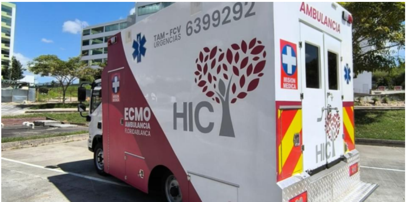
Official handover: the ECMO Ambulance ready for its first mission in Floridablanca

In that silent, urgent journey — monitors lit, ECMO equipment in rhythm, the medical team focused — is written the reason this project exists.