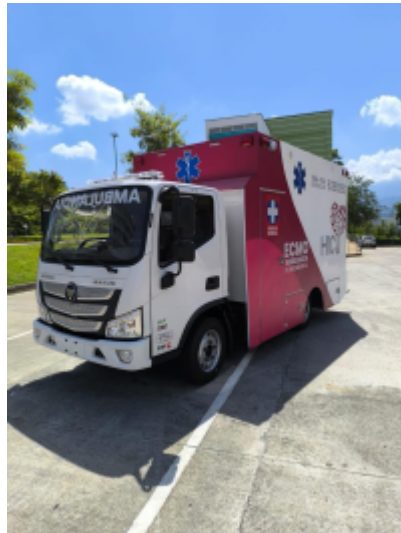
Front view on Foton Aumark chassis — an imposing presence on the road